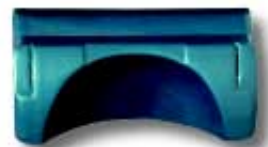
Optional Front Shroud