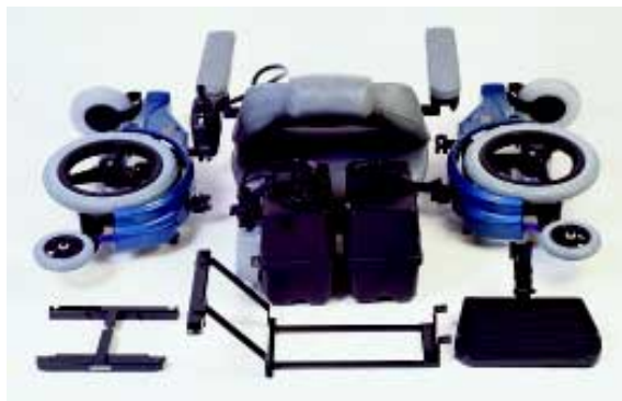
Easy to Disassemble Power Base