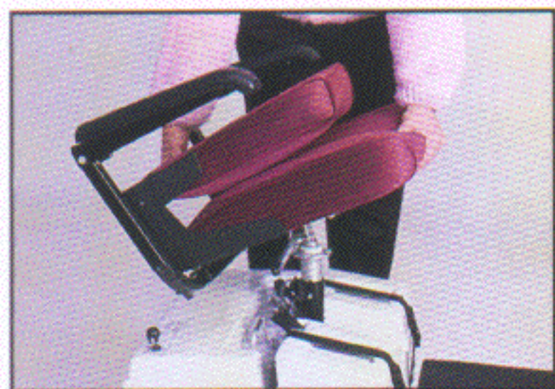
1. Remove seat.