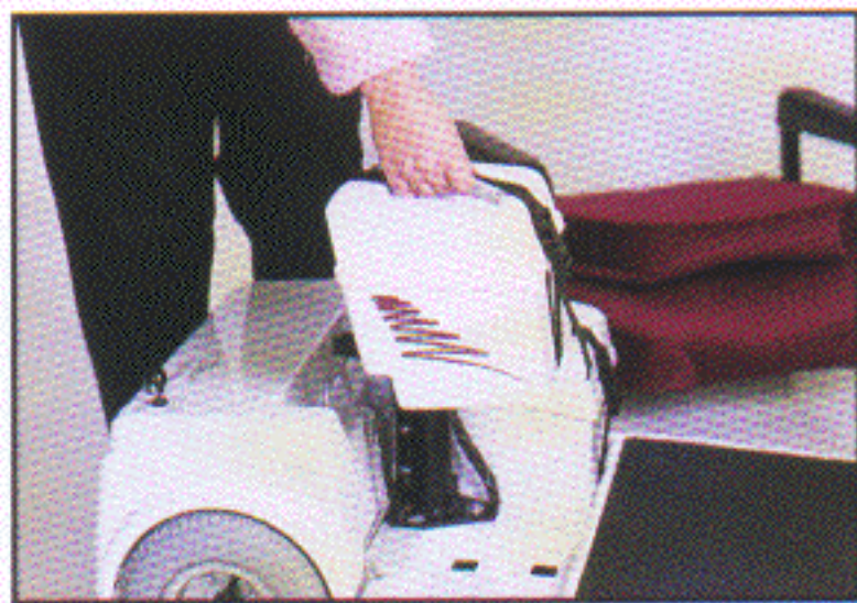
2. Remove batteries.