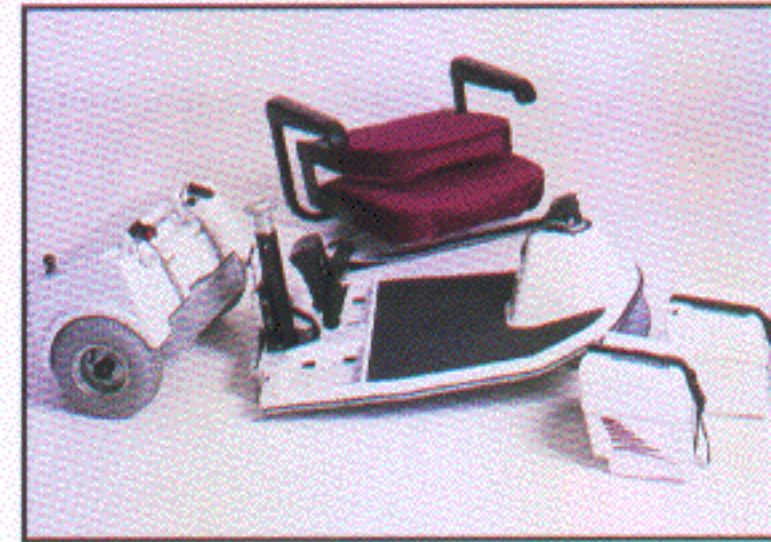
4. Ready for loading.