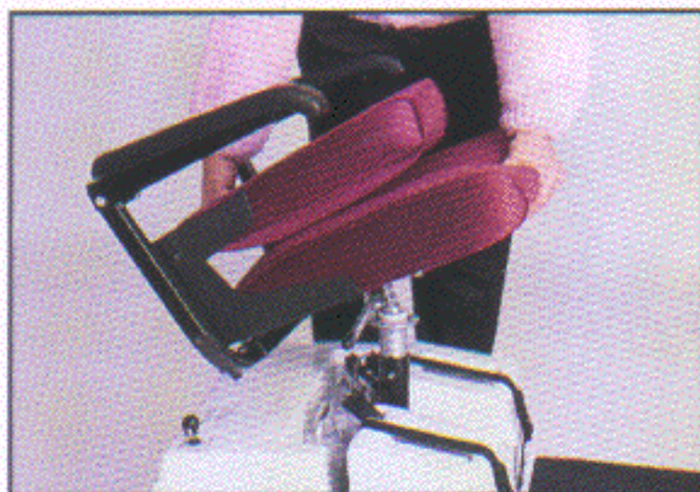
1. Remove seat.