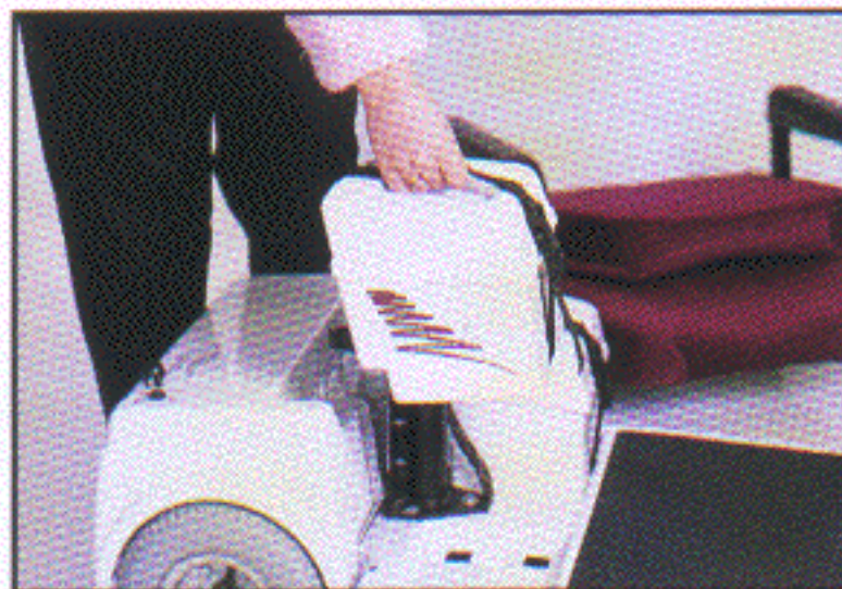
2. Remove batteries.